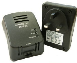
Homeplug Twin Pack £43.50 + VAT Homeplug Single