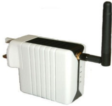
Homeplug Wireless £38.61 + VAT